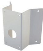
GBR-CM01 Corner Mount Adapter