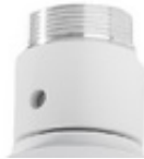
GBR-AM02 Adapter Ring for Pelco Pendant Mount with 1,5" NPT thread