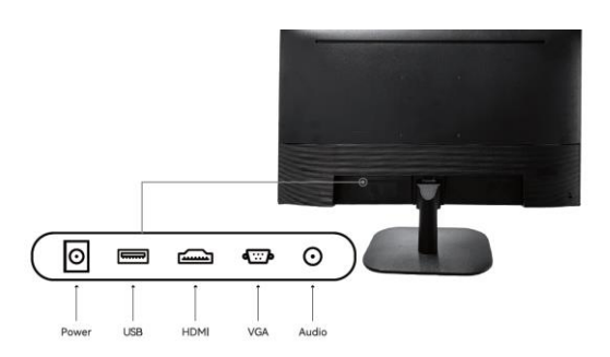
Figure 1-1 Overview of the connections

The overview of the connections is shown below.