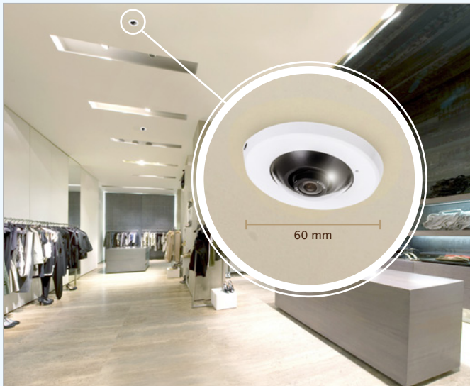
The Stylish Recessed-Mount Fisheye Network Camera