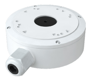
PR-JB14IP66 Large Water-proof Junction Box