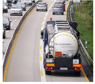
AG Neovo SX-Series