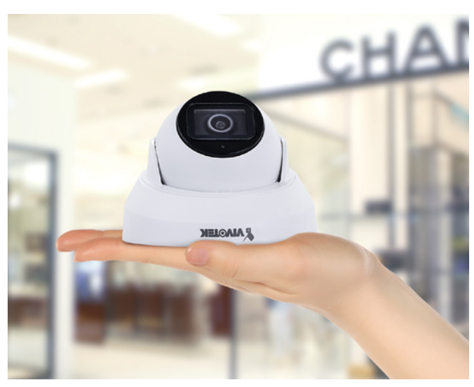
Easy Installation and Compact Size