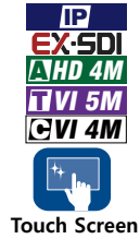
[ SC-IPM07PRO ]