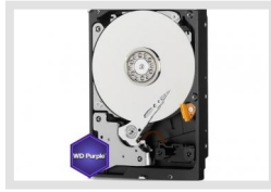
HDD-3000SATA Purple|SKU: 217657