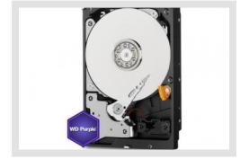
HDD-8000SATA Purple|SKU: 218583