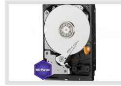
HDD-6000SATA Purple|SKU: 217660