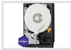
HDD-2000SATA Purple|SKU: 217658