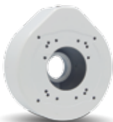
Junction Box (PR-B47JB) is available