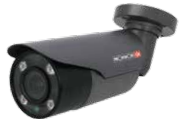
Available in Grey Color

Sensor: 1/3", 2 Mega-Pixel Selectable Output: 1080P AHD / CVI / TVI / Analog Lens: 2.8-12mm Mega-Pixel Vari-Focal True Day & Night – ICR IR Range: 40m (4 Array LED) IP66 CoC Support Weight: 836g Power: DC 12V, ~480mA