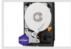
HDD-2000SATA Purple | SKU: 217658