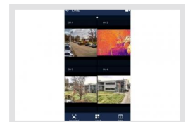
eneo Center mobile |SKU: 217850