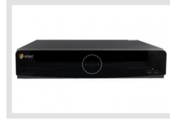
IEM-38R640005A | SKU: 217651