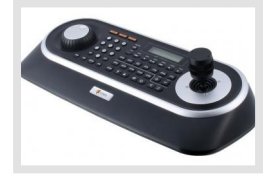
KBD-2USB | SKU: 217652