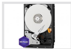
HDD-6000SATA Purple |SKU: 217660